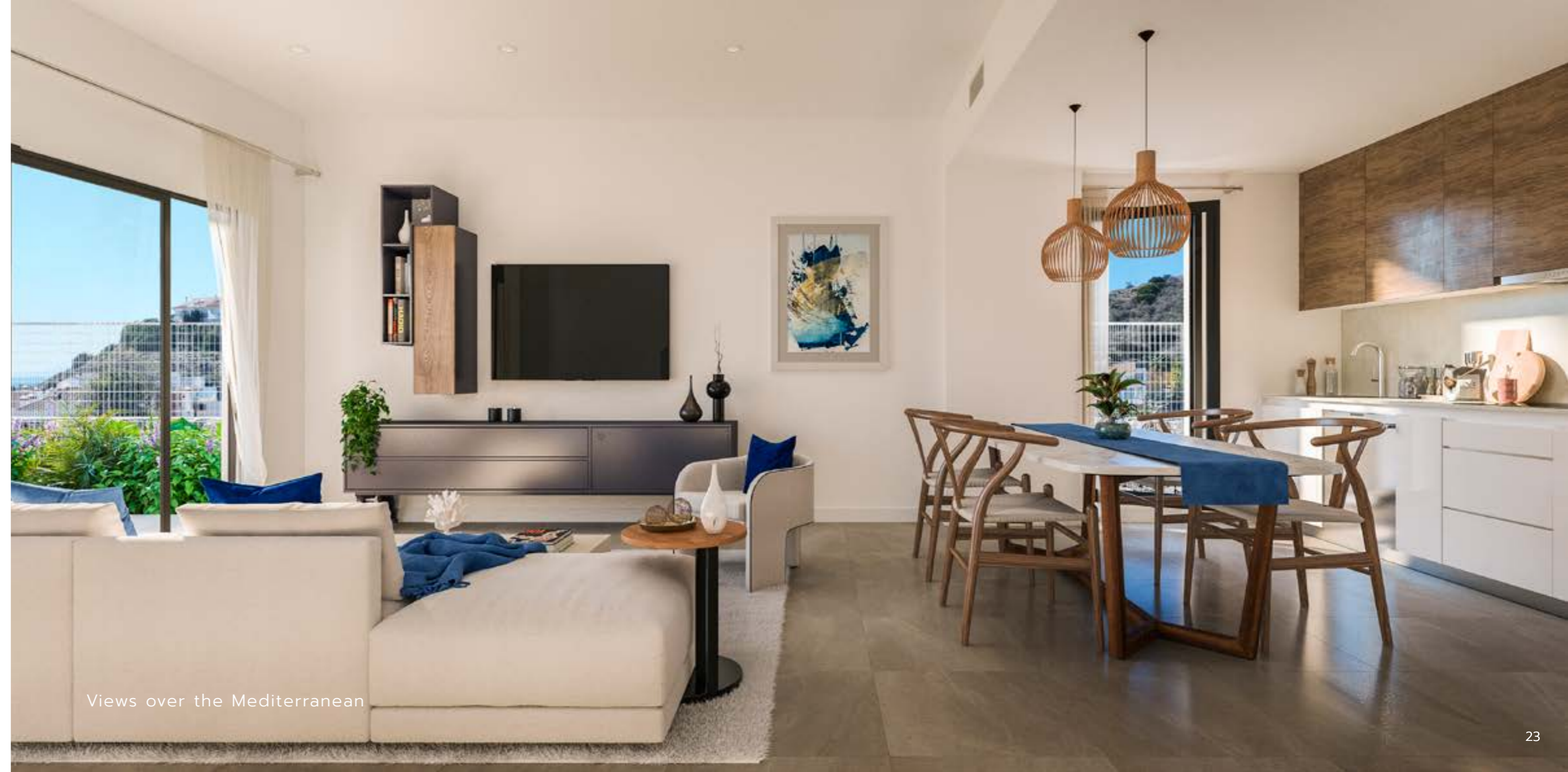
Views over the Mediterranean

The attractive stretch of coastline offers trendy waterfront bars, beach clubs, and an array of water sports. There are numerous golf courses in the vicinity including the Miraflores Golf Club which is situated next to Riviera del Sol. The Calahonda and Cabopino courses are also close by, as is the Mjas Golf Complex.