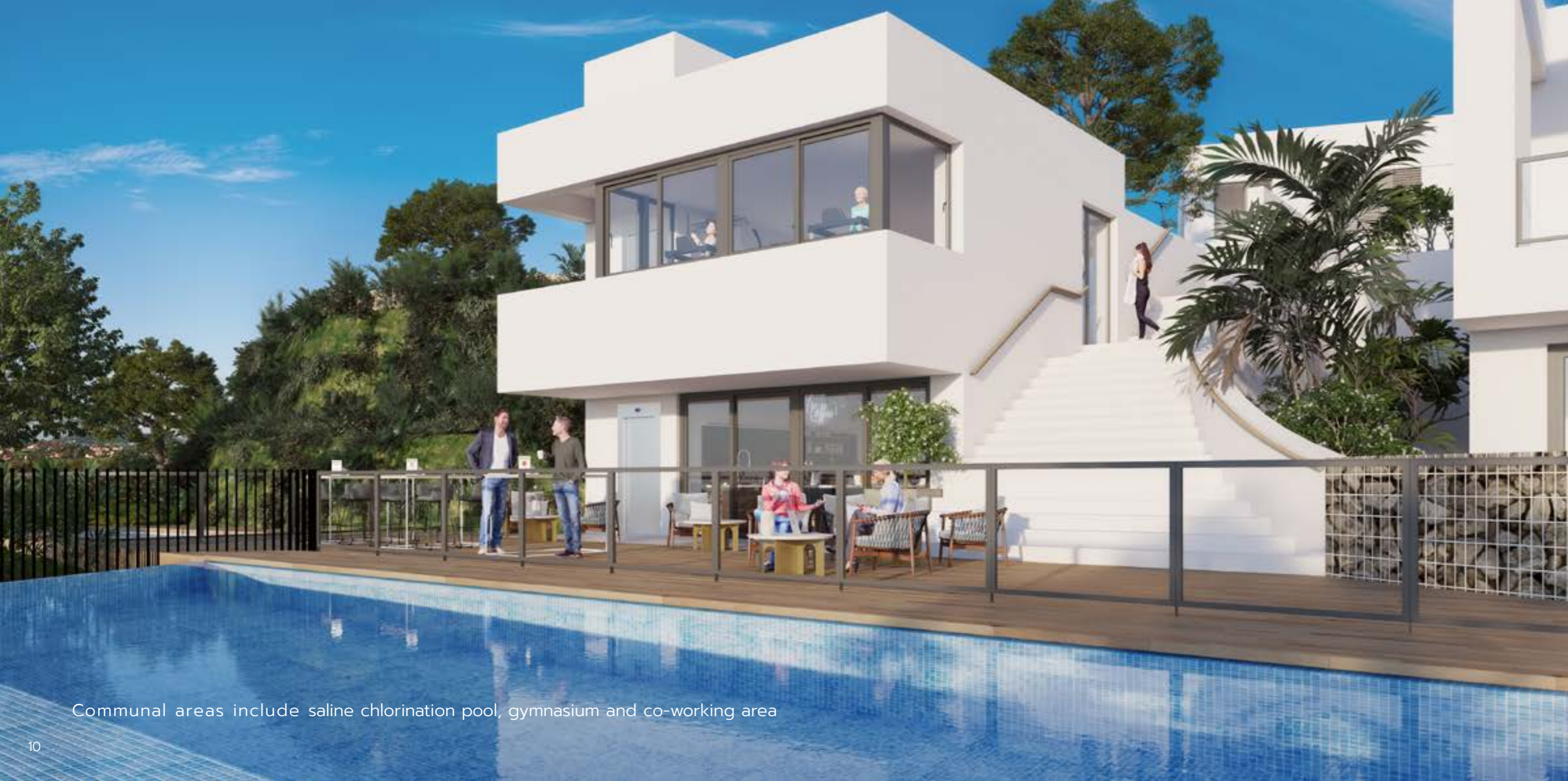
Communal areas include saline chlorination pool, gymnasium and co-working area

The communal areas include a saline chlorination pool with night lighting, gymnasium, co-working area, landscaped garden areas and electric vehicle charging facility.