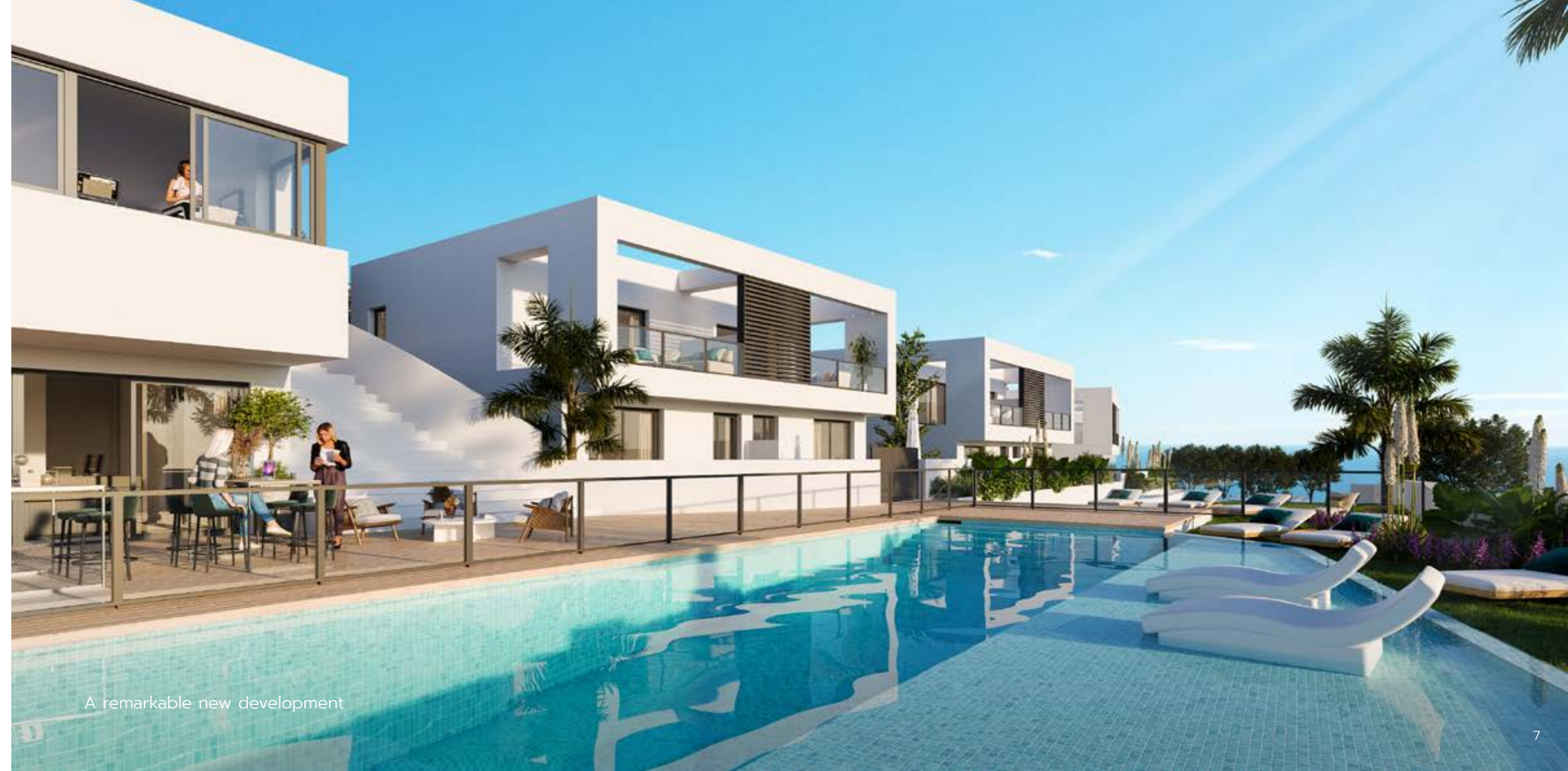
A remarkable new development

Each home has been designed with quality and comfort in mind, and the outdoor space is ideal for enjoying the Costa del Sol's Mediterranean climate.