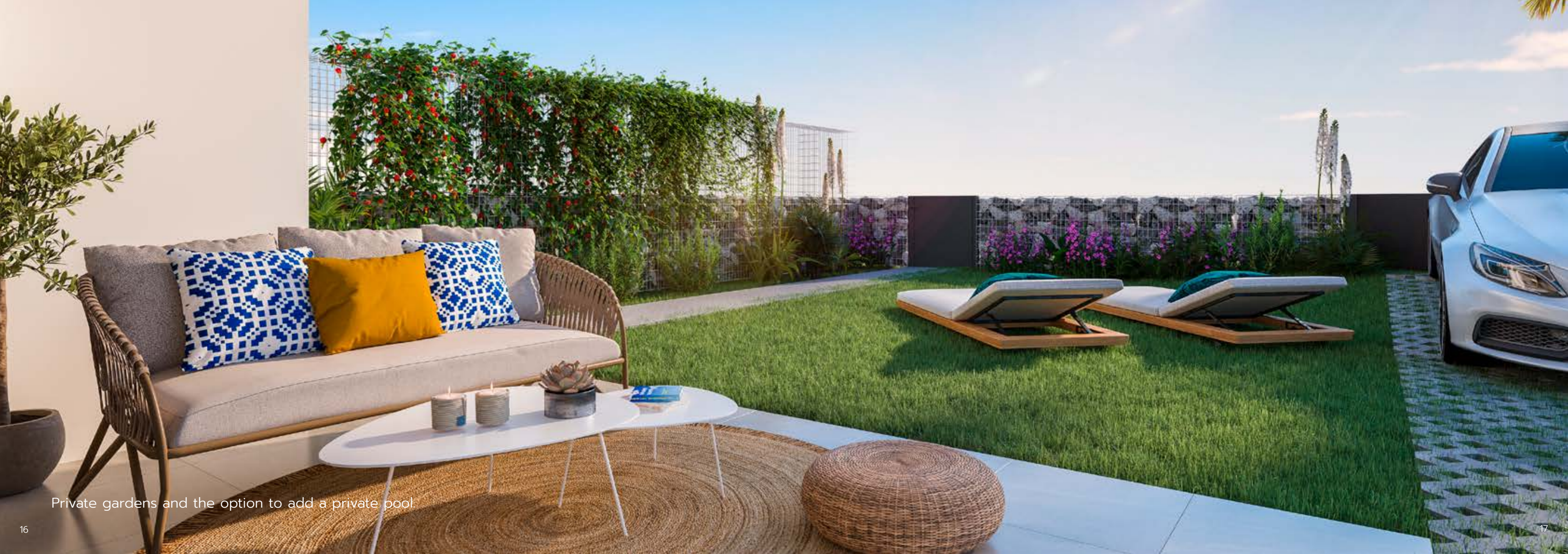
Private gardens and the option to add a private pool.